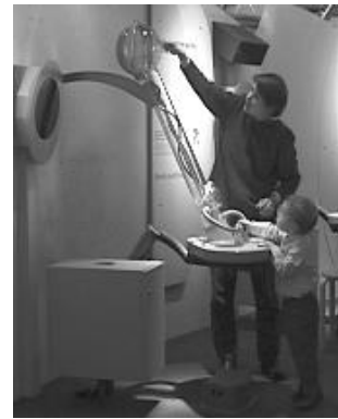
M: And that moves the blood up

Failing to encourage the child to look at the blood circulating the system, the mother transforms the ways in which she attempts to engage her child. With, 'that's just what our heart does', the mother turns her body away from the exhibit and faces the child. By the word 'our', she is bending down and clasping her own chest with both hands. - The child continues to look at the