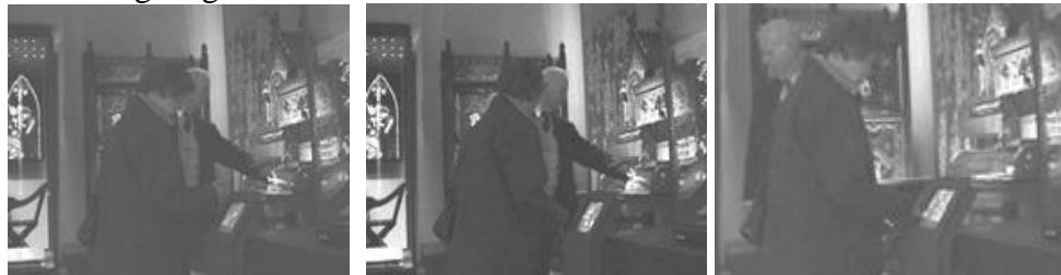
C: British Rail used to have these: D'you remember?