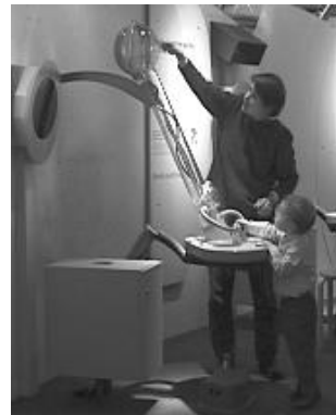
M: And that moves the blood up

Failing to encourage the child to look at the blood circulating the system, the mother transforms the ways in which she attempts to engage her child. With, 'that's just what our heart does', the mother turns her body away from the exhibit and faces the child. By the word 'our', she is bending down and clasping her own chest with both hands. - The child continues to look at the