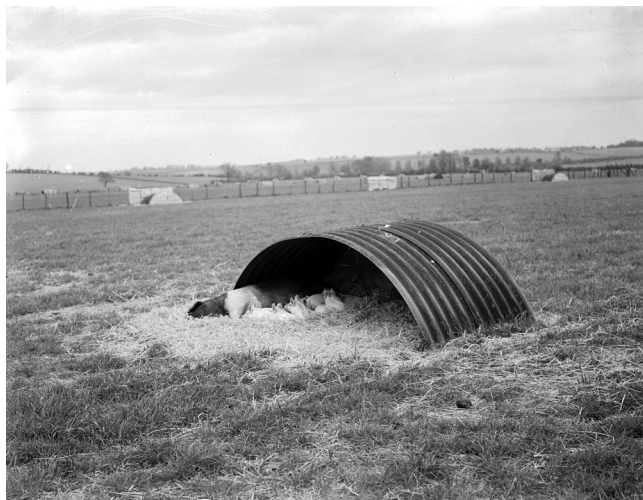
Fig. 2 Pigs and piglets in a field (R. Roadnight, Britwell Salome, 1955). Reproduced by permission of The Museum of English Rural Life, University of Reading, UK

post-WWII decades, and the role played by antibiotics in tackling the health problems which emerged. It shows that antibiotics were ineffective in treating certain diseases and left other infections in their wake. These limitations were widely recognised by pig vets and farmers, and reaffirmed their holistic understandings of disease. Using the disease known as ‘Virus Pneumonia of Pigs’ (VPP, now Enzootic Pneumonia) as a case study, the final section explores what health interventions these parties elected to use instead of antibiotics. The conclusion reflects on the significance of these findings for historical and contemporary understandings of antibiotic use and livestock production.