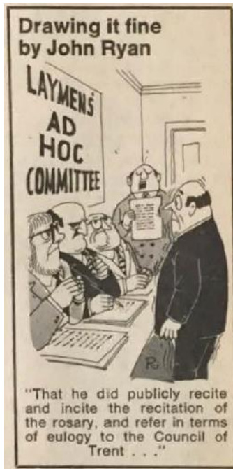
Figure 2: A satirical reflection on lay agency and increasing militancy in response to Humanae Vitae through the eyes of Catholic Herald cartoonist, John Ryan. The Catholic Herald , 1 November 1968, 1. [Copyright permission granted by the estate of John Ryan]