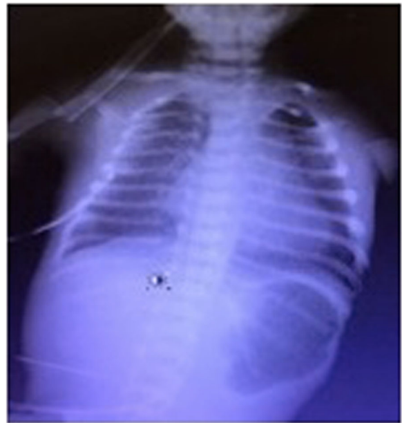
Fig. 3 Radiograph of the abdomen showing gastric dilatation due to pyloric atresia