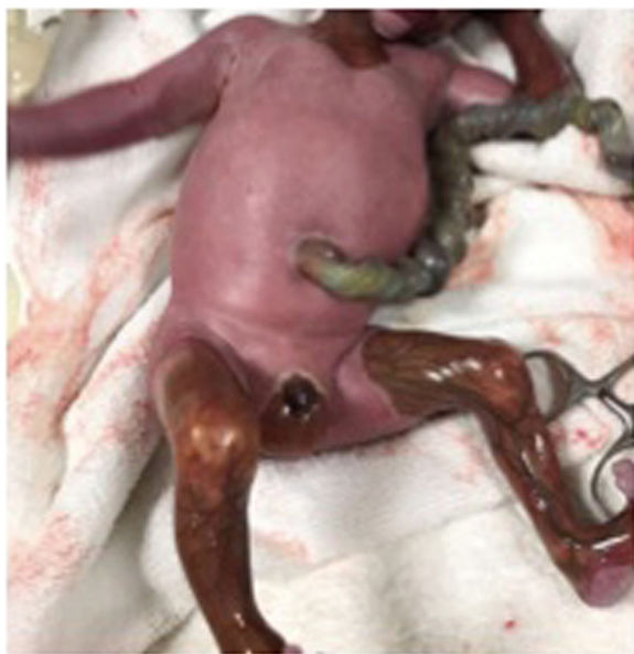
Fig. 1 Aplasia cutis from the left arm, legs, and scrotum of the patient

Written informed consent was obtained from the parent of the patient.