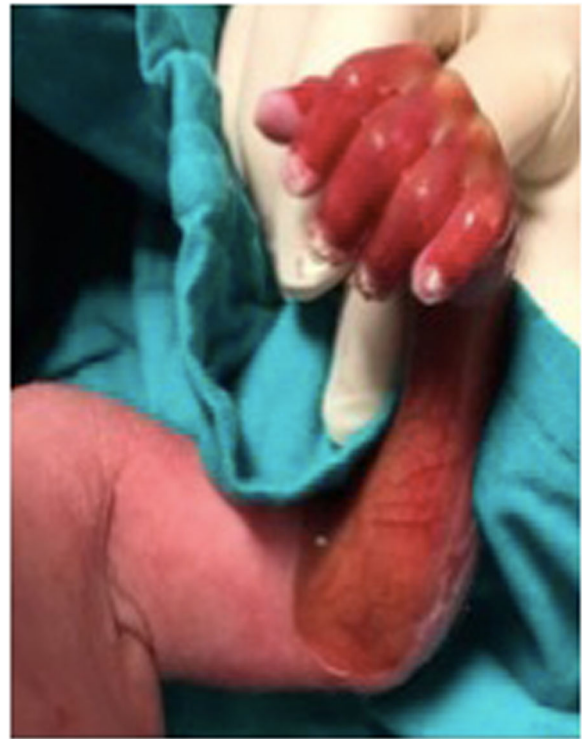
Fig. 2 Dystrophic nails of the patient

A male preterm infant was born at 31 weeks' gestation by vaginal delivery as the first child to consanguineous parents with a birth weight of 1620 g. On prenatal ultrasonography, gastric dilatation and unilateral hydronephrosis were described. He received positive pressure ventilation at the delivery room and transferred to neonatal intensive care unit after stabilization. On physical examination, the skin was absent on the face, anterior side of the left forearm, both legs, and scrotum. He had multiple bullous lesions on the right arm, along with dystrophic nails. The radiograph of the abdomen showed gastric bubble resembling that of pyloric stenosis (Figs. 1, 2, and 3). Bilateral hydronephrosis and left ureterocele were detected by abdominal ultrasonography. Echocardiography and cranial ultrasonography were normal. The patient was intubated due to respiratory failure at the 2nd day of his life. Skin biopsy was performed and confirmed the diagnosis of EB. During follow-up, intravenous hydration was increased and parenteral nutrition and intravenous albumin were administered. He could