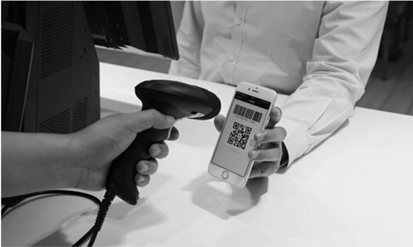
Figure 2: A shopper uses Alipay's QR Code to pay for his purchase

send virtual red envelopes, a built-in function of Alipay or WeChat Pay apps, rather than traditional red paper envelopes. 46 Around the world, mobile payment takes place in a variety of forms, including near-field communication (NFC or contactless), QR codes and cloud-based pay, depending on different technologies adopted. In Europe, mobile payment services usually embrace the NFC technology, which means shoppers swiping their smartphones over a chip reader. 47 In contrast, most mobile payment transactions in China have been conducted through QR codes generated by mobile payment apps. Consumers use their Alipay app to generate a one-off QR code and then retailers will hold a special reading gun to scan the QR code and complete the transaction (see fig.2 below). Alternatively, some retailers print out their Alipay's accounts (presented as QR codes) near the counter for shoppers to use their smartphone cameras to scan and make payment.