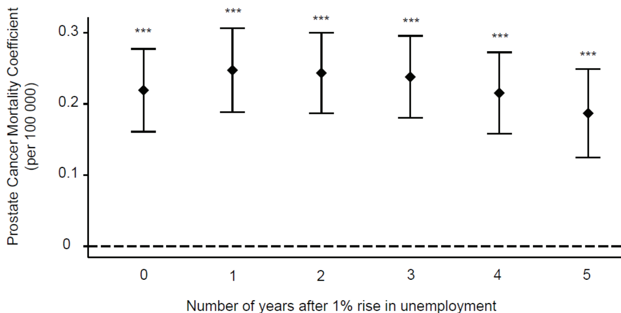
Figure 1. Time-lag analysis of unemployment and prostate cancer mortality. Multivariate regression analysis was used to assess the relationship between prostate cancer mortality and increased unemployment. The prostate cancer mortality coefficients and their corresponding CI are displayed for the time frame of up to five years after a 1% rise in unemployment. *** p < 0.001 .