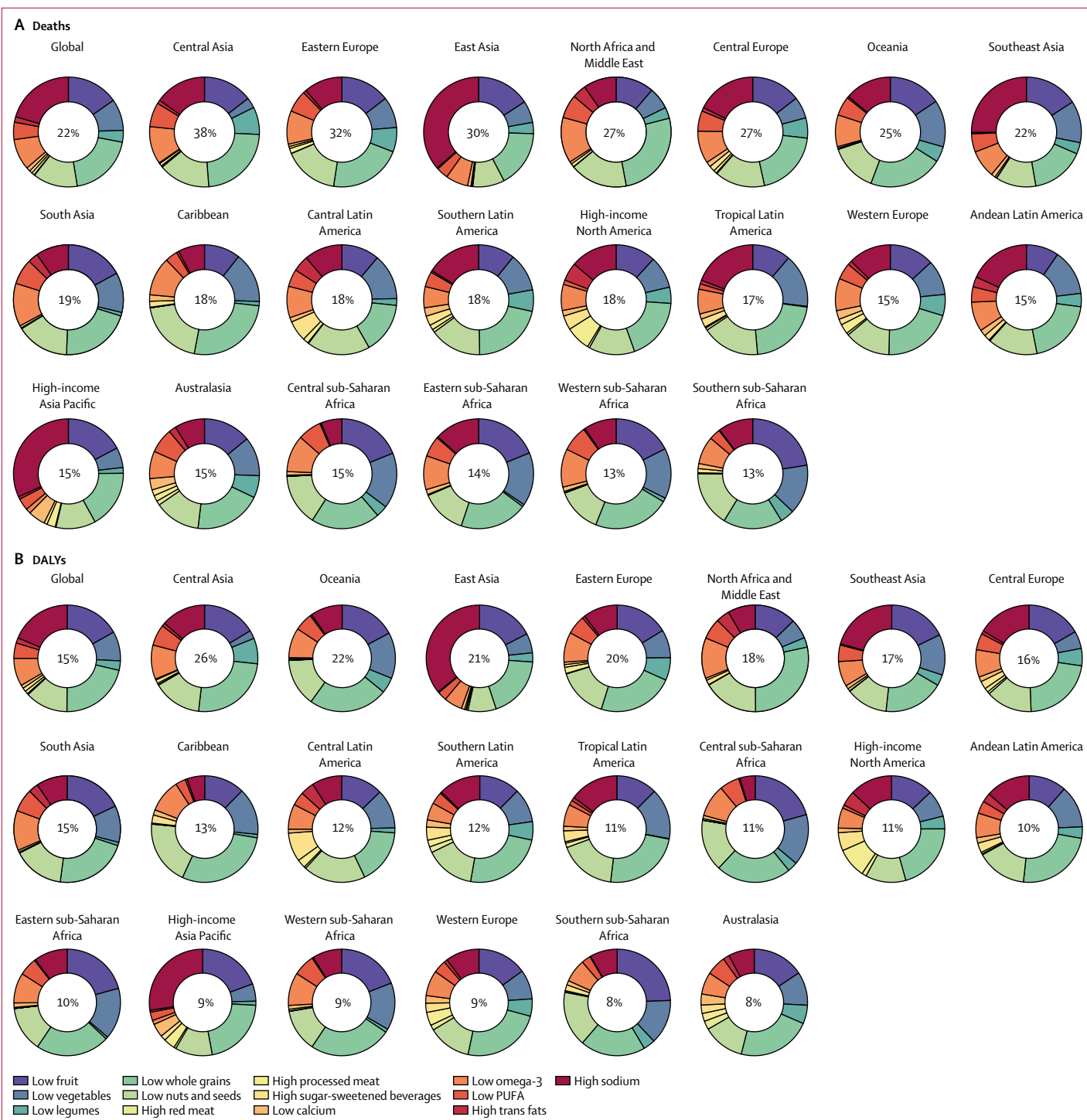
Figure 4: Age-standardised proportions of deaths and DALYs attributable to individual dietary risks at the global and regional level in 2017 DALYs=disability-adjusted life-years.

The lowest burden of exposure to dietary risk was observed in high SDI countries (139 [129–148] deaths per 100 000 population and 3032 [2802–3265] DALYs per 100 000 population). Low-middle SDI had the highest age-standardised rates of diet-related deaths and DALYs