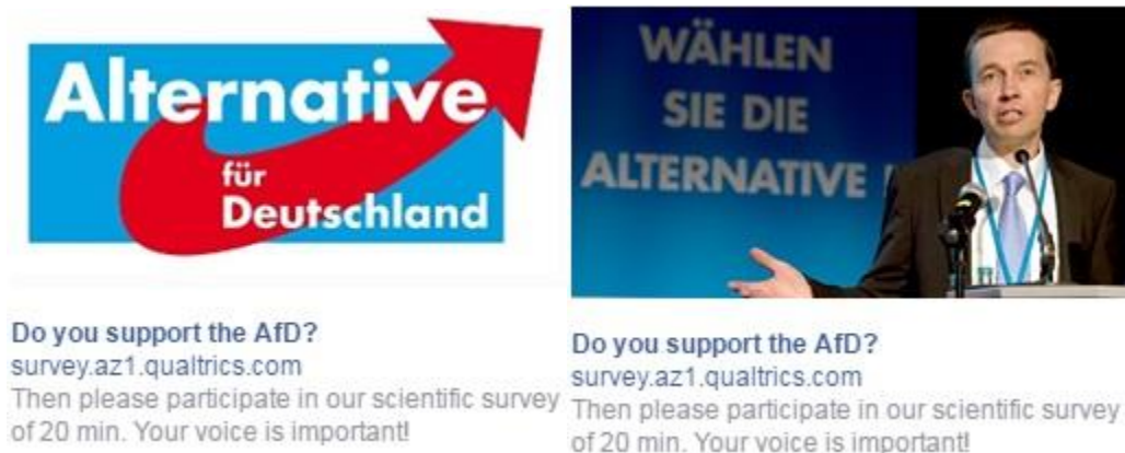
Figure A1. Facebook Ads for supporters of the AfD, English translation.

Note: The header and description were limited to 40 and 90 characters for advertisement on the right column. These limits do not apply for Ads on the desktop news feed, allowing for more information about the survey, such as the university affiliation.