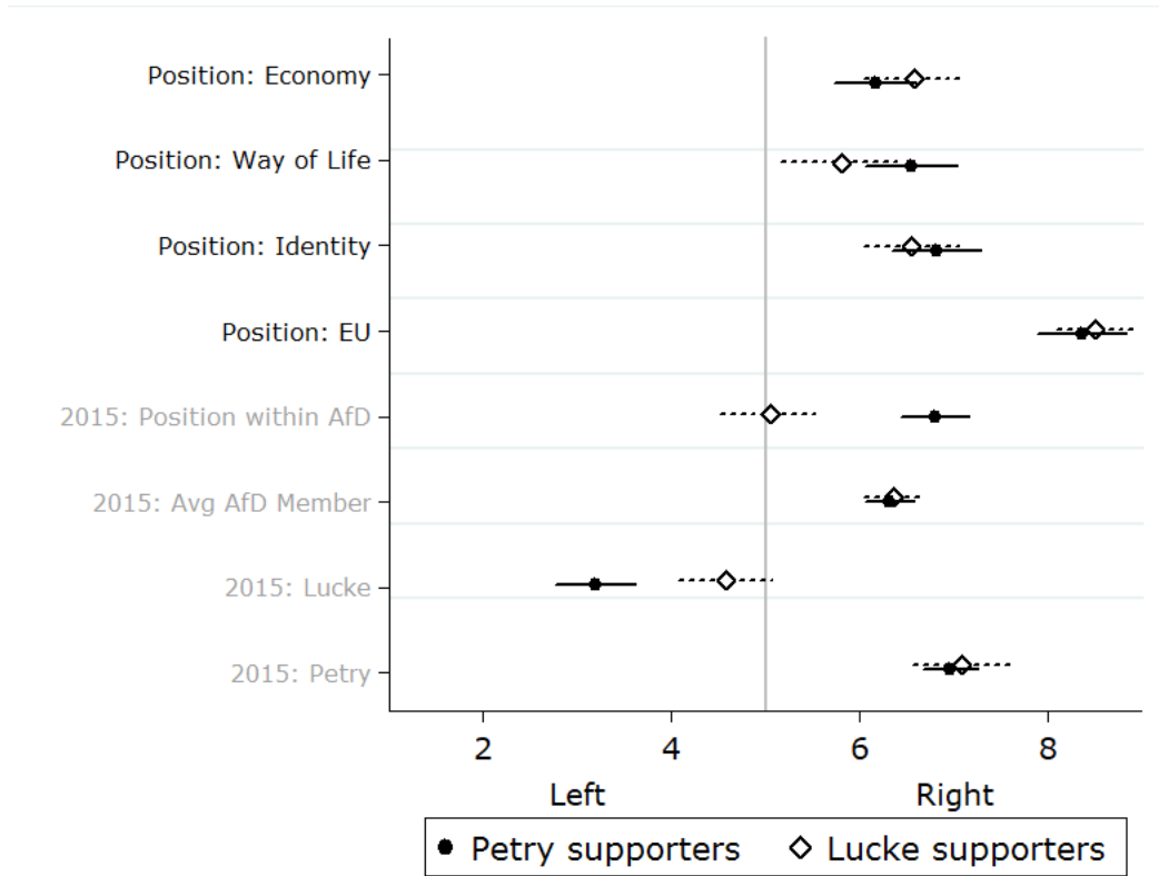
Figure 1. Positions by Petry and Lucke supporters in political space

Note: Error bars give the 95-percent confidence interval. Black entries refer to the 2013 sample, grey entries to the 2015 sample.