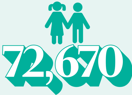
children were in care in England in 2017