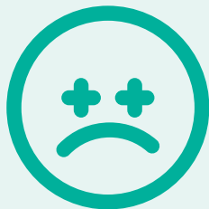
female care leavers have a baby when they are a teenager

4-5x Care leavers are four to five times more likely to harm themselves than other young people