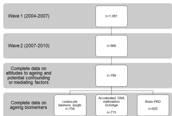
Figure 1 Sample sizes at waves 1 and 2. Brain-PAD, brain-predicted age difference.

Of the 866 participants in wave 2, 789 (91%) had complete data on attitudes to ageing and covariates. Of these 789 participants, 758 (96%) had data on leucocyte telomere length, 715 (91%) had data on AgeAccelGrim and 622 (79%) had data on brain-PAD (figure 1). Compared with these 622 participants,