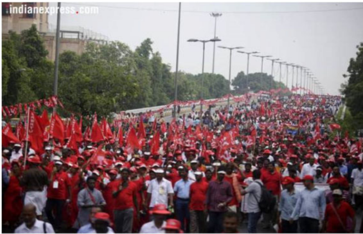
Worker-Farmer Rally in Delhi, September 2018, ©THE INDIAN EXPRESS [P] LIMITED.