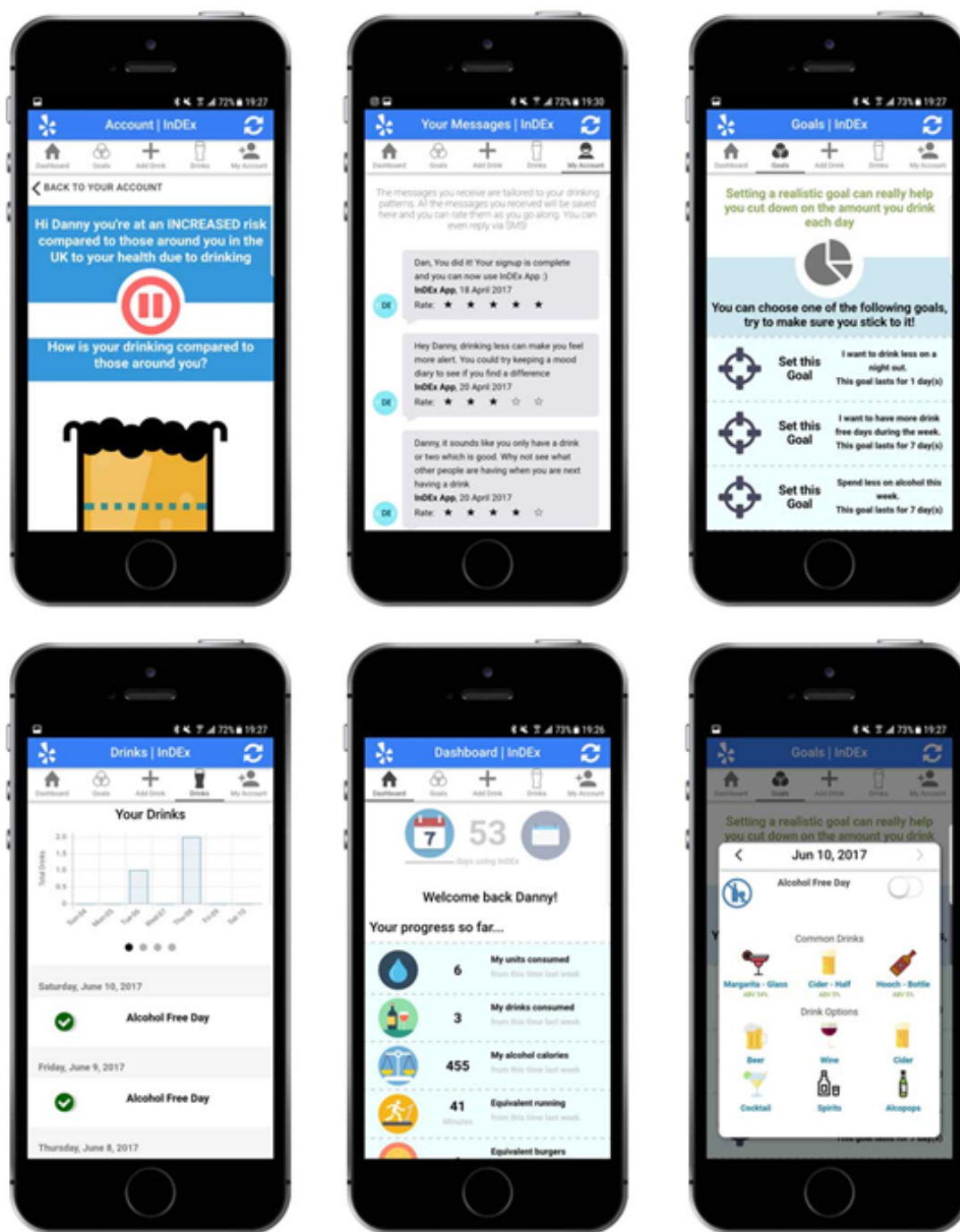
Figure 1. Example screenshots of interactions with the InDEx app. Top left to bottom right: normative feedback, personalized text message history, set a goal, drink diary, dashboard, and add a drink. InDEx: Information about Drinking in Ex-serving personnel.