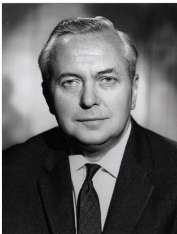
A new era? Wilson presented his case as one of political, social and industrial renewal.

This argument was hardly original; rather it is a recurring one throughout a post-war era of technological change. Thus, rather than showing a particularly prescient political leader, it demonstrates that when it comes to those elusive and confusing notions of "science" and "technology", intelligent people spoke much the same nonsense they do today. Rubbishy techno-futurism encapsulated in brain-rotting clichés is still the way elites want us to think about these matters. It appeals to cynical politicians too – it suggests the past or present are no guide, we must move on, wipe our minds of what we know, ready for the brave new world of the future. In British politics techno-futurism has been the refuge of scoundrels. Wilson's speech was in part that of a cunning political operator, exploiting techno-futurism in just this way. It is why it has been recommended to more recent Labour leaders.