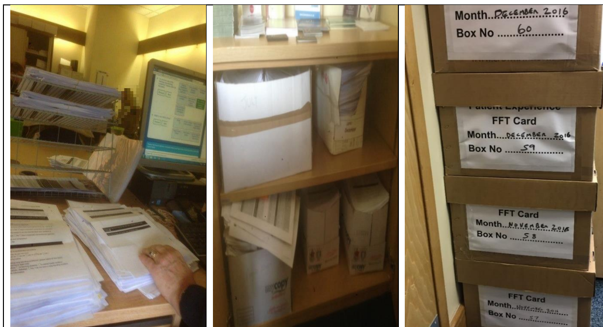
Figure 2 - FFT paper forms being entered in the electronic database and archived FFT cards at Hospitals A and C

The above are two examples of the transformations we observed and examined in the process of ‘following’ the life of the FFT – as well as of other technologies to collect patient experience - during our fieldwork. These examples draw attention to what we call the ‘multiplicity of FFT’. They show how ‘the FFT’ that comes to interact with a ward manager is necessarily different to ‘the FFT’ a matron comes into contact with, or a member of the Patient Experience team, or an executive director at the Board meeting and so on. In other words, when we refer to the Friends and Family Test, we are naming and thereby discursively fixing a meaning for an entity that is, in actual fact, multiple. Even though for practical purposes we call FFT a recommendation rate, a dashboard, a card with questions and comments, a report, etc – these are all different things with which different people and organisational mechanisms interact. They are not simply different ‘components’ of the test, but different entities altogether. The FFT is a set of rates (recommendation and response) and a trend to Board members; it is a pile of cards to decipher and transform into digital data and possibly urgent action for a Patient Experience team; it is a section of a report that is