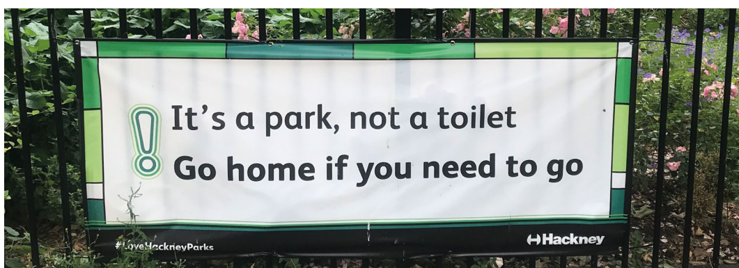
Figure 1: "Go home if you need to go." What happens if you are unhoused and need water or sanitation access?

This widespread closure of public toilets and water sources – during a global pandemic, no less, when the prevailing public health advice was to wash your hands well and often 4 – reveals the importance of water-related services as a public good. More nefariously, these emergency policies – including the use of shame and stigmatization (see Figure 1) directed at people who are unable to access a bathroom – turns a harsh spotlight on an entire population that routinely experiences water, toilet, and sanitation insecurity. While the Covid-19 closures were likely many Londoners' first encounter with insecure access to water and sanitation, such conditions are a daily reality for unhoused (homeless) people. 5 After all, when the institutional policy is "go home if you need to go," to quote Hackney Council, what happens if you do not have a 'home'?