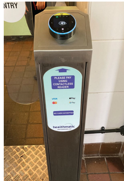
Figure 2: Barriers to entry. Since 2015, Royal Parks charges people to use the toilet in Greenwich Park.

Fourth and finally, unhoused people are disproportionately exposed to environmental