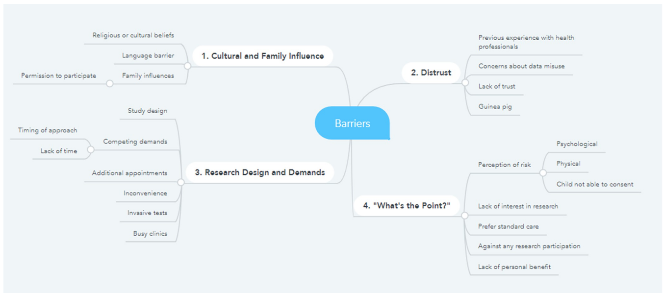
Fig 2. Thematic maps of barriers and facilitators.

https://doi.org/10.1371/journal.pone.0282088.g002