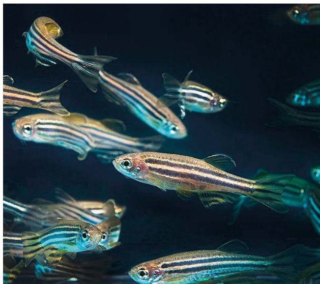
Figure 1: The zebrafish (Danio rerio) is one of the most common fish species used to investigate the behavioural effects of pharmaceuticals in the laboratory setting.