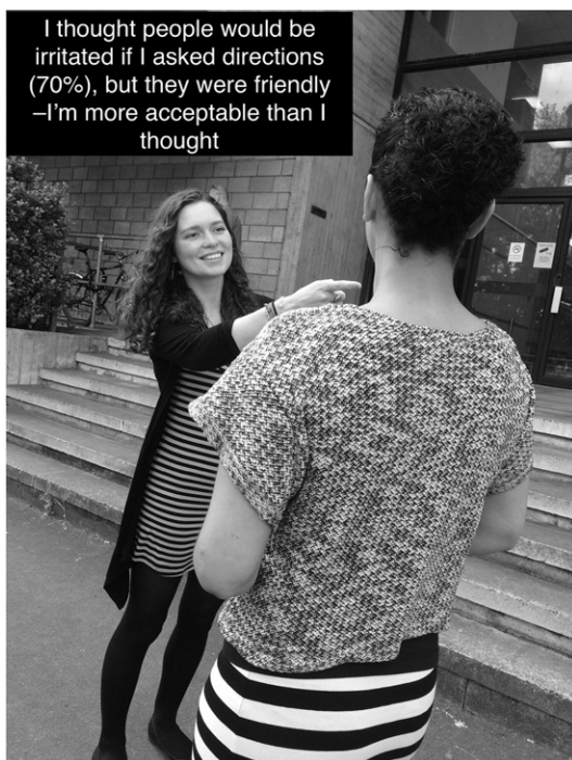
Figure 1. Flashcard demonstrating a stranger's kind response when approached by the patient who had predicted rejection.

Still images can also be a wonderful way to capture moments when patients realize they come across much better than their internal feelings and self-perceptions tell them they do (e.g., I look bright red, panicky, have wide scared looking eyes). For example, a patient reported feeling she blushed 80% red while giving a presentation to a small audience during her therapy. Prior to viewing the