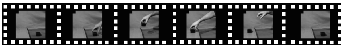
18 19 Figure 1. Screenshots from an exemplar box lifting video.

Stimuli for the weight judgement task were taken from Pobric and Hamilton (2006) and comprised five videos of a hand lifting visually indistinguishable boxes of five different weights (approximately 50g, 250g, 450g, 650g, and 850g). Each video (4400ms duration) commenced with an image of a box on a table next to a low shelf. After a short delay a hand entered the screen from the right, lifted the box, placed it on the shelf, and exited the screen (see Figure 1).