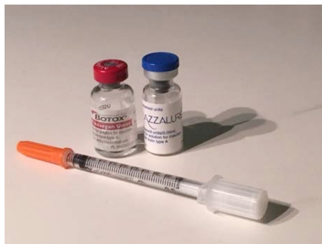
Figure 5: Photograph of two of the brands commonly used in the UK.

Despite heterogeneity between studies, those with direct comparisons suggest that AbobotulinumtoxinA (Allergan, Dysport – please refer to Figure 4) is superior to OnabotulinumtoxinA (Botox, Allergan), and IncobotulinumtoxinA (Bocouture, Merz) may be even better, as the remainder of the studies using this toxin find the results to be ongoing at the end of the study duration, so no end point can be clearly extrapolated. This is illustrated in Figure 3.